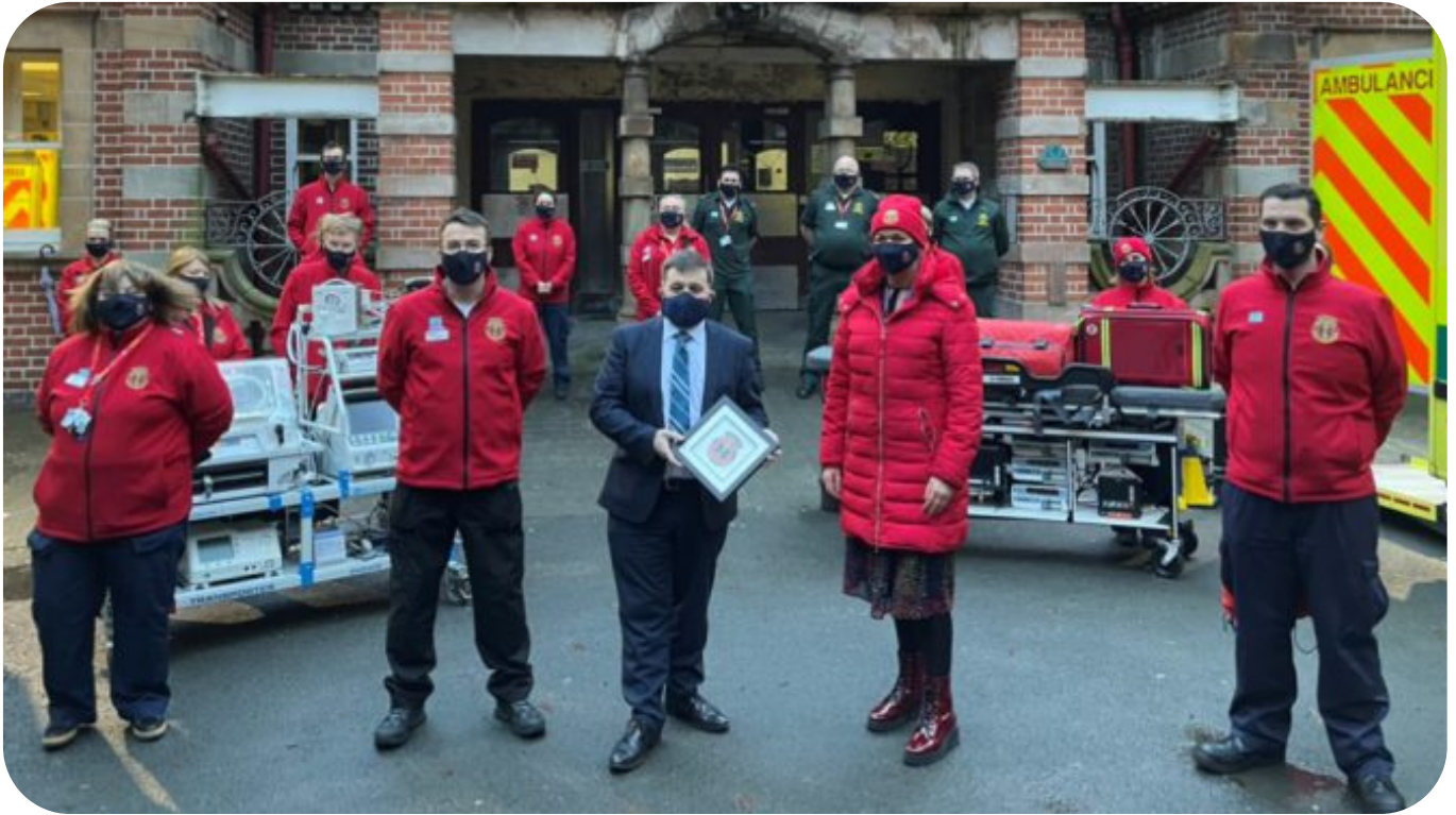
Health Minister Robin Swann thanking the NISTAR team for their efforts throughout the covid pandemic

In early 2020 the NISTAR (Northern Ireland Specialist Transfer and Retrieval) service launched our dedicated nurse led transport team. A first in the UK.