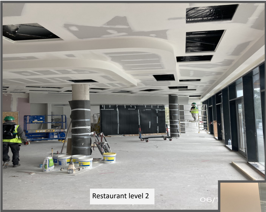
Restaurant level 2