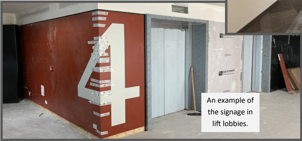
An example of the signage in lift lobbies.