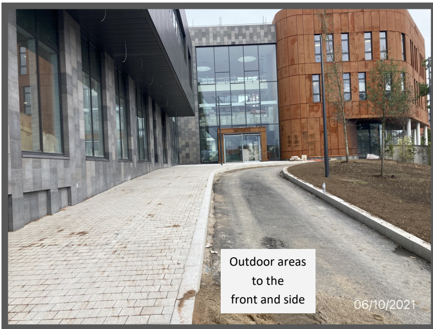
Outdoor areas to the front and side