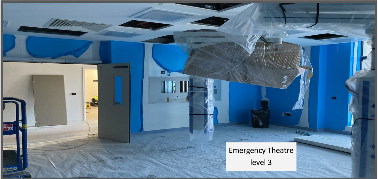
Emergency Theatre level 3