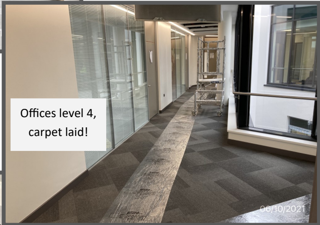
Offices level 4, carpet laid!