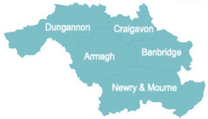
Southern HSC Trust area

Within ICS NI, five Area Integrated Partnership Boards (AIPBs) will be established within the same boundaries as Trust geographical areas.