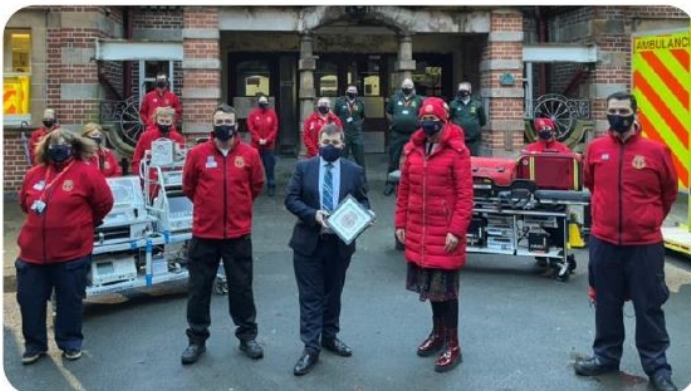
Health Minister Robin Swann thanking the NISTAR team for their efforts throughout the covid pandemic

The Northern Ireland Specialist Transport and Retrieval Nurse Led Team is a year old. The service was a first in the UK and has been involved in some extraordinary work in the past year. NISTAR is extremely proud of the positive impact this team is having on patients.